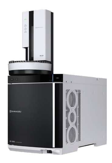
Fig. 1 Shimadzu's Brevis<sup>™</sup> GC with AOC<sup>™</sup>-30i

This application news demonstrates the use of GC-FID for analyzing EG and DEG contaminants in glycerin, propylene glycol (PG), and sorbitol solutions (70%) (both crystallizing and non-crystallizing) in accordance with the Indian Pharmacopoeia (IP) monographs. Shimadzu's Brevis GC, featuring a compact design with a width that is approximately 35% smaller than existing GC models, is used in this experiment (Fig. 1). This design allows the Brevis GC to occupy less space in the laboratory and to be eco-friendly with reduced power consumption, while maintaining analytical performance and enhancing productivity.