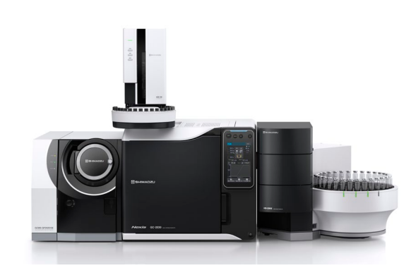
Fig 1. HS-20 NX + GCMS-QP2020 NX

The method detection limit (MDL) and limit of quantitation (LOQ) were assessed by analyzing the standard at a concentration of 2.5 \mu g/L in seven replicates. To assess for accuracy and precision of this method, the recovery test was evaluated by analyzing the standard at a concentration of 5 \mu g/L in three replicates. The analysis of instrumental conditions of HS-GC/MS were as shown in Table 2.